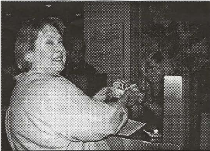
Recently an Alexandria bank's security camera captured this image of a robbery taking place. Police suspect the teller (shown smiling like a cat who's swallowed the canary) may be involved. A $10,000 reward is available to anyone with information that leads to the capture and conviction of the unknown assailant