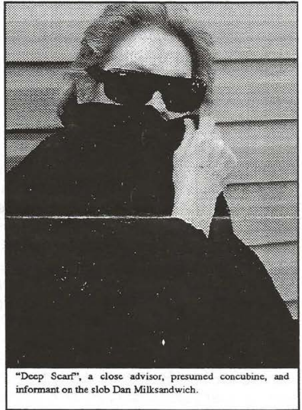
"Deep Scarf", a close advisor, presumed concubine, and informant on the slob Dan Milksandwich.