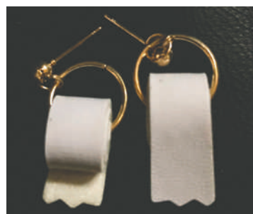
Which way to wear these? This week's second-prize earrings.

Submit up to 25 entries at wapo.st/enter-invite-1513 (no capitals in the web address). Deadline is Monday night, Nov. 14; results appear Dec. 4 in print, Dec. 1 online.