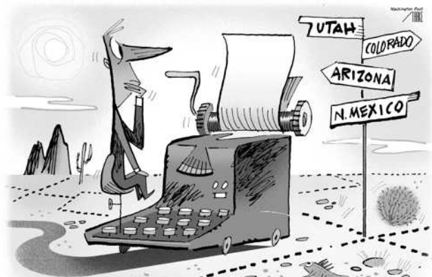
BOB STAAKE FOR THE WASHINGTON POST

To "If I Only Had a Brain" ("sung" by Count Dracula) I could while away an hour And happily devour A magnum of champagne; Better yet (and delicious!) Would be blood (it's quite nutritious!), If I only had a vein. I would love to taste your