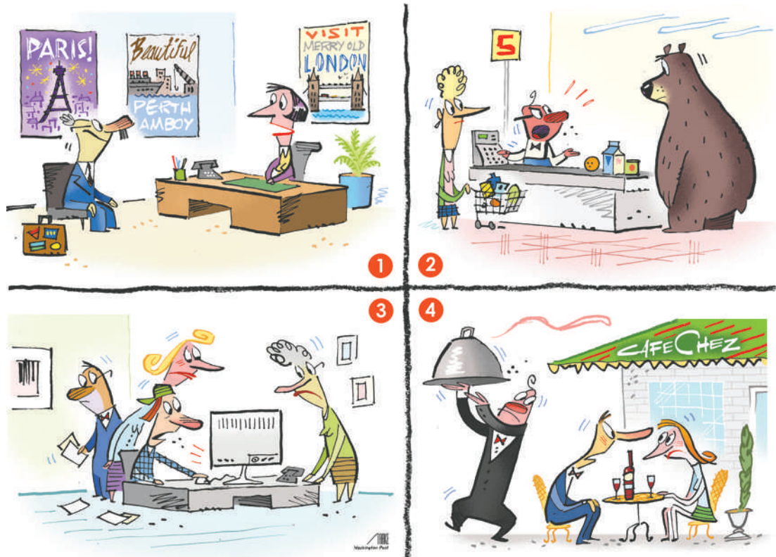
BOB STAAKE FOR THE WASHINGTON POST