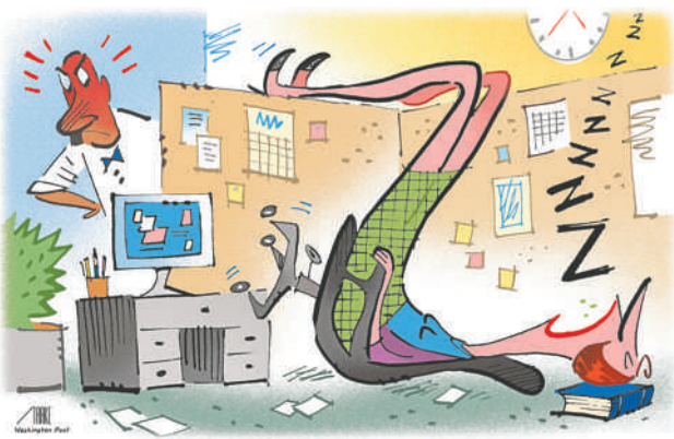
BOB STAAKE FOR THE WASHINGTON POST

What's the difference between Biden and Trump? Trump knows better than to ride a bicycle. (Frank Osen)