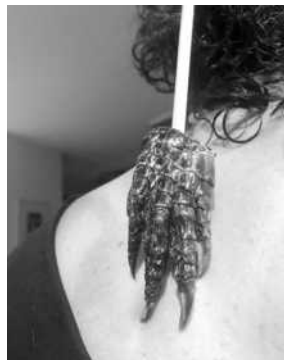
The alligator back scratcher. Felt pretty scratchy!

Submit up to 25 entries at wapo.st/enter-invite-1491 (no capitals in the Web address). Deadline is Monday, June 13; results appear July 3 in print. June 30 online.