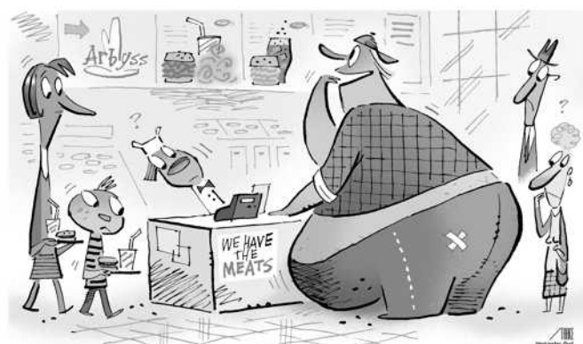
BOB STAAKE/ILLUSTRATION FOR THE WASHINGTON POST