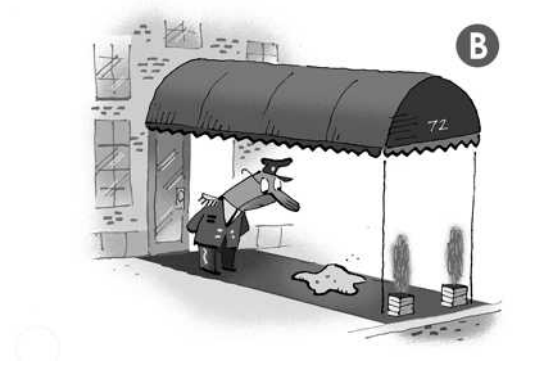
CARTOONS BY BOB STAAKE FOR THE WASHINGTON POST

As we insist on doing year after year, we put up some inscrutable Bob Staake cartoons and asked for captions. The Empress received more than 1,300 entries, as many as 400 for a single cartoon. See the cartoons in color at wapo.st/invite1468.