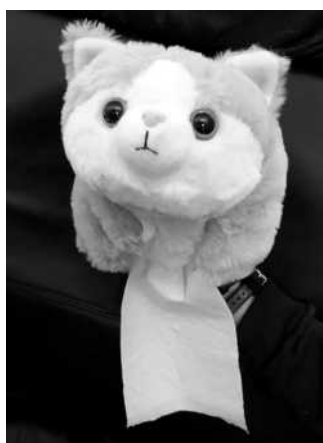
Your tissues or toilet paper will be warm as a cat's innards!

The Style Conversational: The Empress's weekly online column discusses each new contest and set of results. See this week's (which will feature the Week 609 ink) at wapo.st/conv1466 .