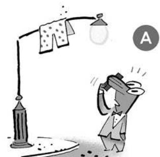
CARTOONS BY BOB STAAKE FOR THE WASHINGTON POST

Week 1425 was the umptieth in a series of Bob Staake cartoon caption contests.