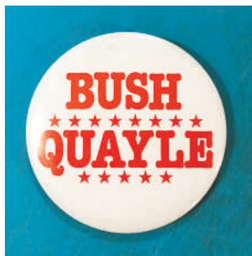
The GOP in the Before Times: This week's second prize.

The Style Conversational: The Empress's weekly online column reviews each new contest and set of results. See wapo.st/conv1387 .