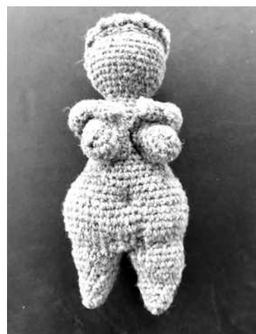
BY DAWN ZURELL FROM A PATTERN FROM TRISHAGURUMI.COM

The Style Conversational: The Empress's weekly online column reviews each new contest and set of results. Check it out at wapo.st/conv1366 .