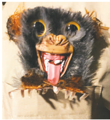
From a little box in your pocket, BOING up pops a monster. This week's second prize.

The Style Conversational: The Empress's weekly online column reviews each new contest and set of results. This week, remembering the Invite's brush with the late Don Imus. Check it out at wapo.st/conv1365 .