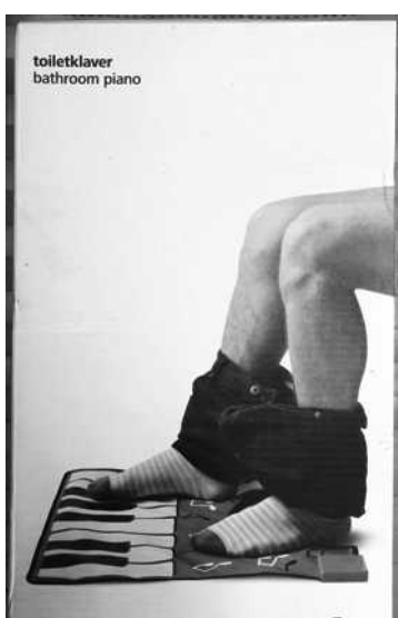
Why just sit there when you can tap out a jaunty tune? This week's second prize.

The Style Conversational: The Empress's weekly online column discusses the week's new contest and results. This week, an answer key to the Week 1342 results. See it at wapo.st/conv1346 .