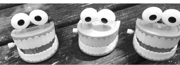
The chattering class: This week's second prize.

The Style Conversational: The Empress's weekly online column discusses each new contest and set of results.