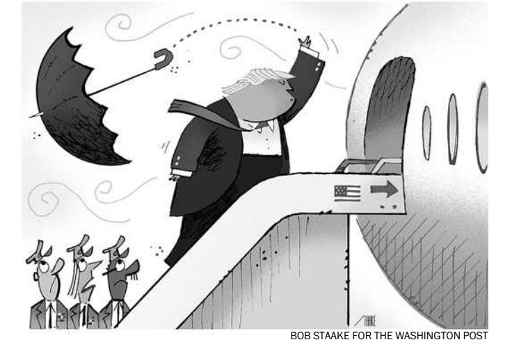
BOB STAAKE FOR THE WASHINGTON POST