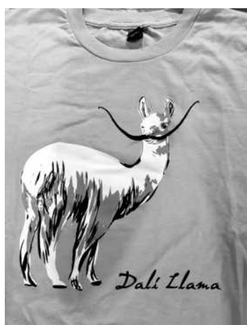
This week's second prize: a two-homophone T-shirt.

● The Style Conversational: The Empress's weekly online column discusses each new contest and set of results. Especially if you plan to enter, check it out at wapo.st/styleconv .