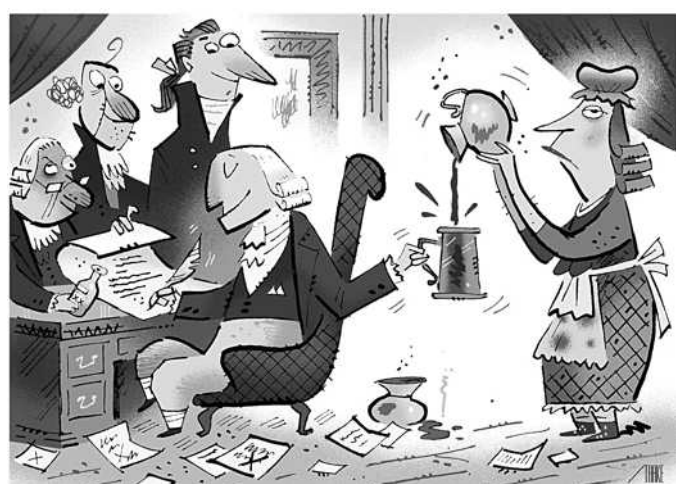
BOB STAAKE FOR THE WASHINGTON POST