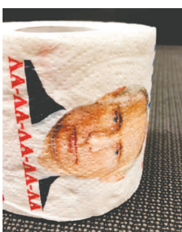
From Kiev, this week's second prize. (The Russian obscenity is hidden in the photo; what's shown says "la la la.")