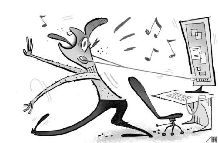
BOB STAAKE FOR THE WASHINGTON POST