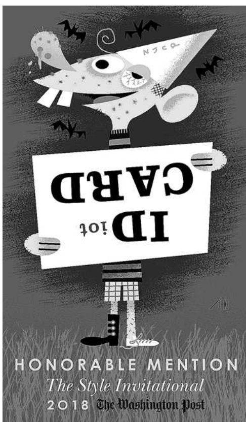
HONORABLE MENTION The Style Invitational 2018 The Washington Post

THE STYLE CONVERSATIONAL The Empress's weekly online column discusses each new contest and set of results. Especially if you plan to enter, check it out at wapo.st/styleconv .