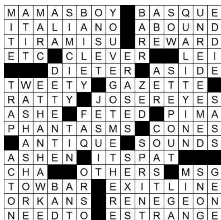
GRID BY EVAN BIRNHOLZ/DEVILCROSS.COM