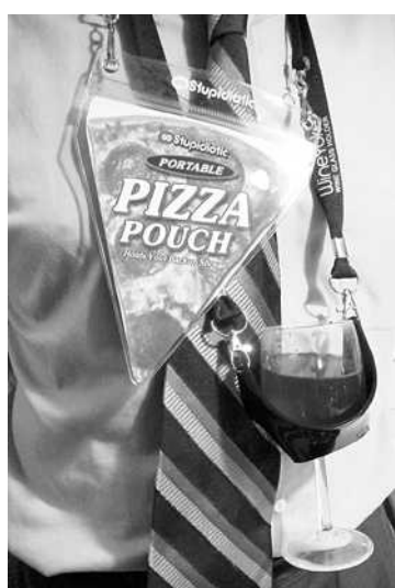
PAT MYERS/THE WASHINGTON POST

THE STYLE CONVERSATIONAL The Empress’s weekly online column discusses each new contest and set of results. Especially if you plan to enter, check it out at wapo.st/styleconv .