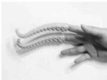
Don't call them tentacles. They're arms. Okay, these would be fingers.

THE STYLE CONVERSATIONAL, the Empress's weekly online column, isn't happening this week, but the E will take questions at pat.myers@washpost.com .