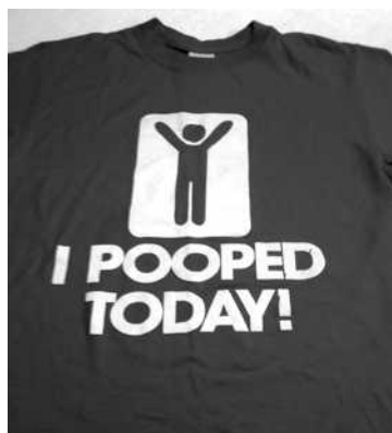
It's adult-size, of course. Brag about your achievements in this week's second prize.

THE STYLE CONVERSATIONAL The Empress's weekly online column discusses each new contest and set of results. Especially if you plan to enter, check it out at wapo.st/styleconv .