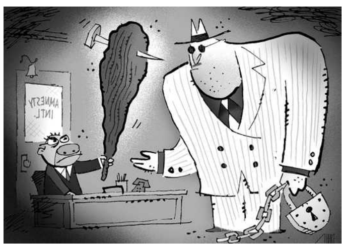
BOB STAAKE FOR THE WASHINGTON POST