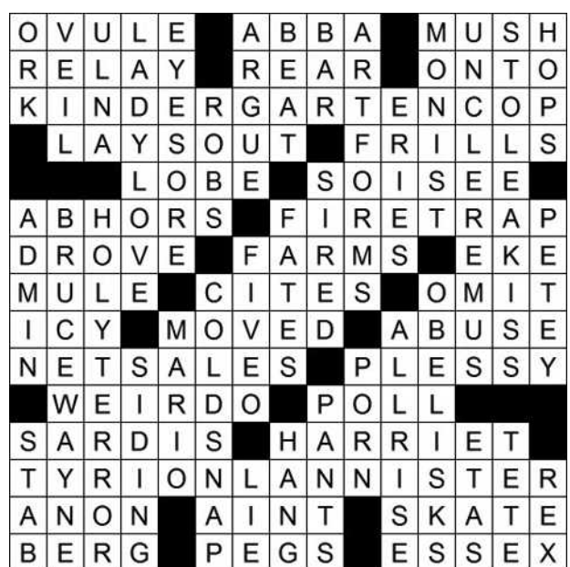
GRID BY EVAN BIRNHOLOZ AT DEVILCROSS.COM

Still running — deadline Monday night, Feb. 8: our contest to redefine an existing word. See bit.ly/invite1160 .