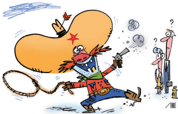
BOB STAAKE FOR THE WASHINGTON POST

Is it just me, or do you also think Texans must have had to sign a pledge to reinforce their stereotype when they’re in public? ( Neal Starkman, Seattle, a First Offender )