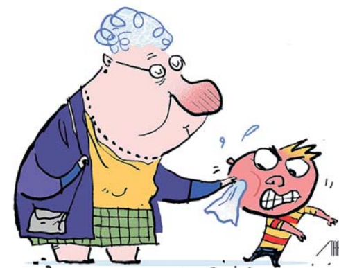
BOB STAAKE FOR THE WASHINGTON POST