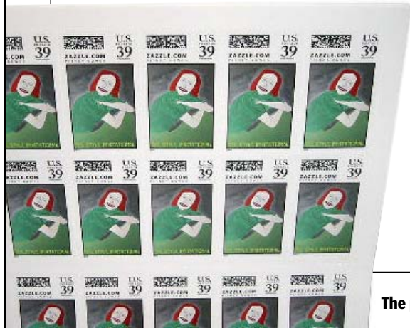
The prize: The only stamp that looks better after canceling.