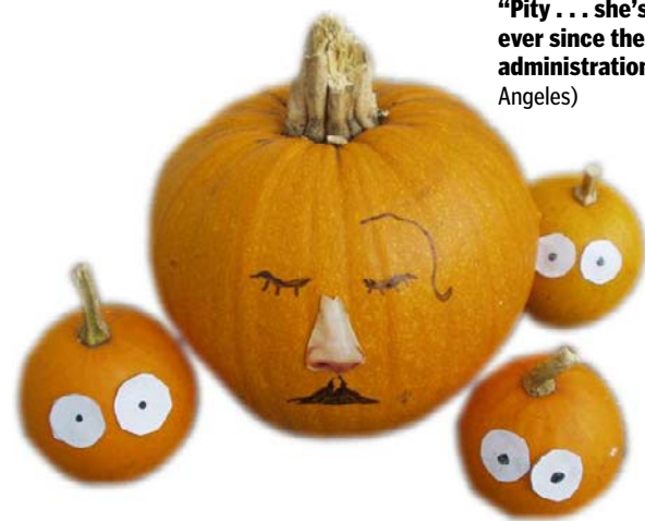
Jack-o-Lantern.