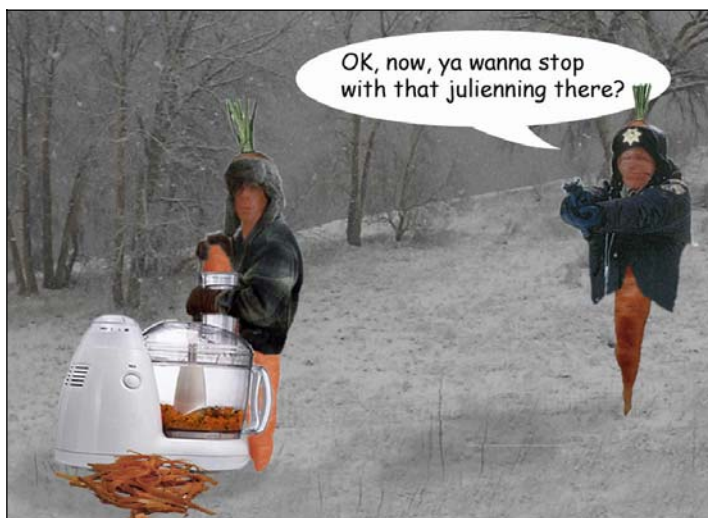
The famous Cuisinart scene from "Fargo."