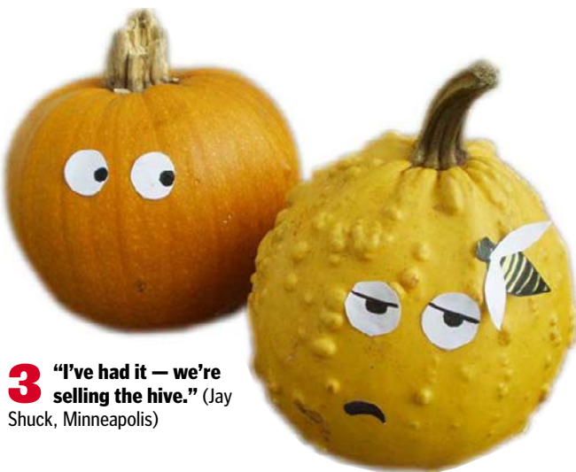
3 "I've had it — we're selling the hive." (Jay Shuck, Minneapolis)

Our second photo contest, this time asking for funny takes on pumpkins and other vegetables. Yes, we used tomatoes in the fruit contest, too. Who are we to say?