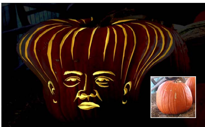
Kim Jong Il has mushroom clouds in his head.