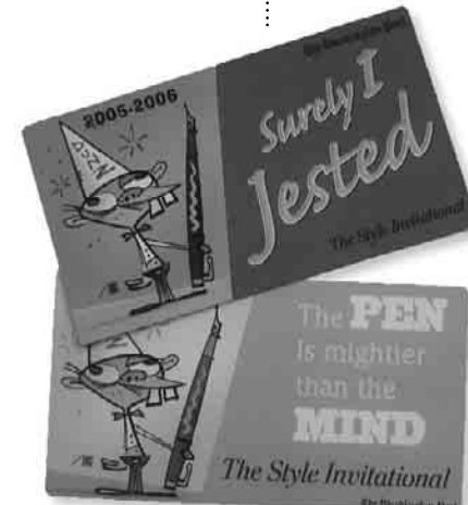
Honorable mentions walk away with the lusted-after Style Invitational magnets.

Next Week: Your Secret Here, or The Battle of Divulge