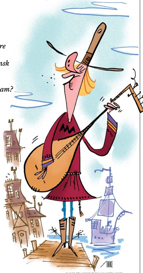
BY BOB STAAKE FOR THE WASHINGTON POST

Sea urchin sushi The Hanseatic League The preservative sodium benzoate Marzipan The S&P 500 The Beijing Olympics Fluorescent light bulbs Prince Valiant Tungsten, bismuth and/or molybdenum Burkina Faso The Smoot-Hawley Tariff Act "The NewsHour With Jim Lehrer"