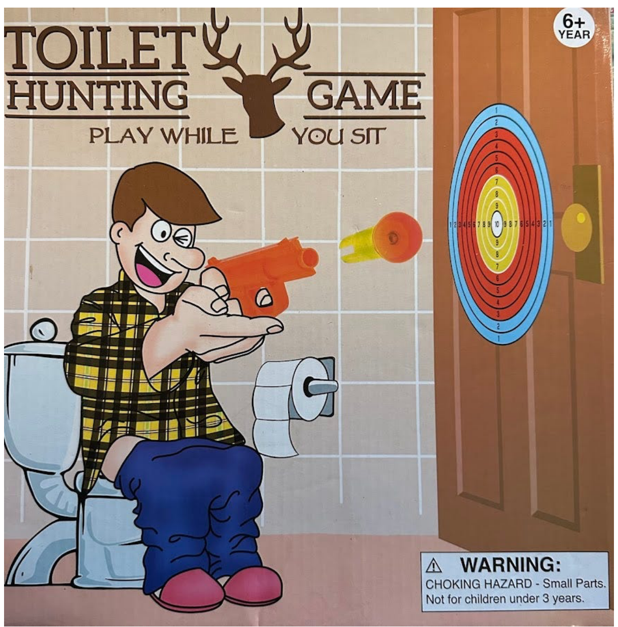
They TOLD you to improve your aim, right? This week's prize.

Runners-up get autographed fake money featuring the Czar or Empress, in one of <u>eight nifty designs</u>. Honorable mentions get bupkis, except for a personal email from the E, plus the <u>Fir Stink for First Ink</u> for First Offenders.