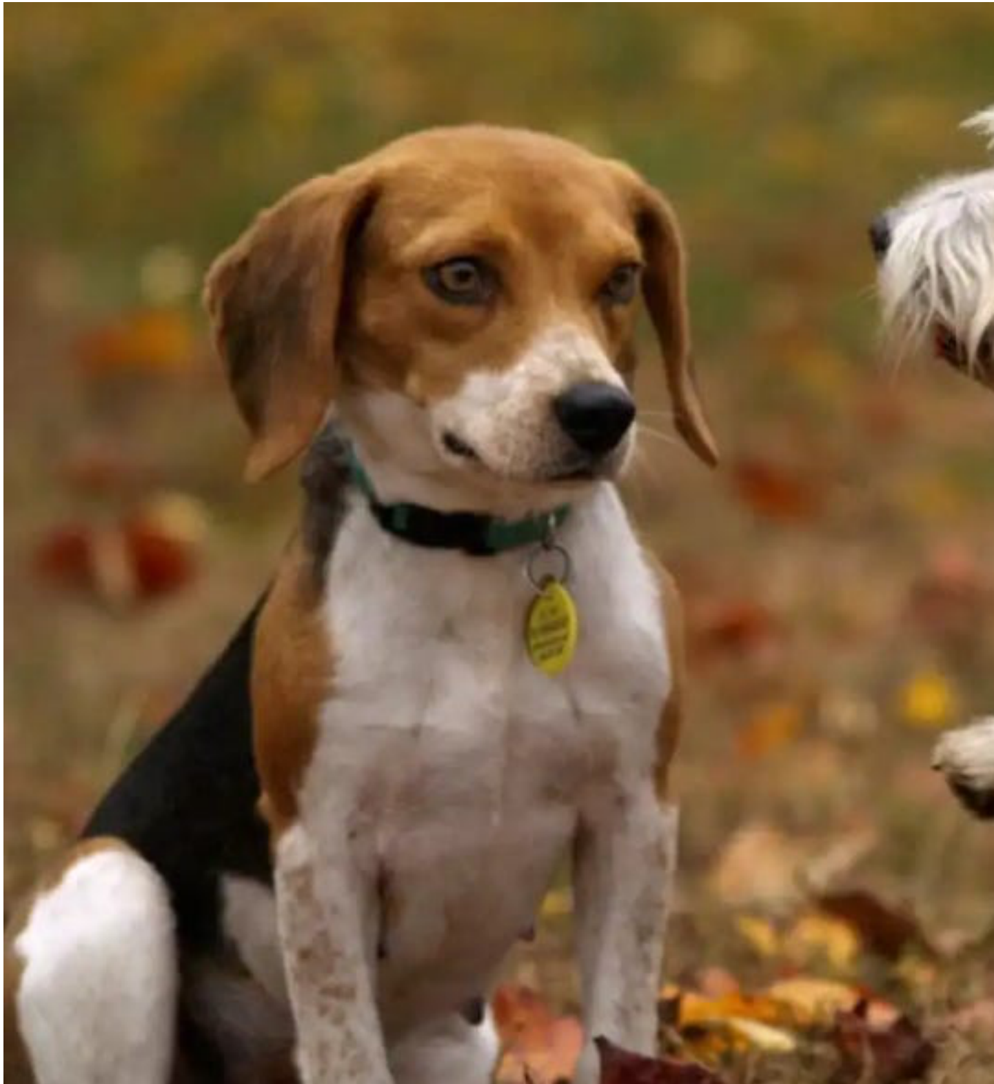
The first of the pictures in The Invitational's caption contest this week.