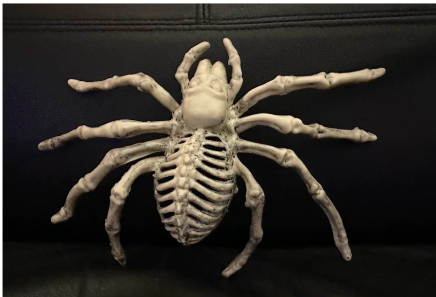
Not for use in science class: This week's second prize.

Submit up to 25 entries at wapo.st/enter-invite-1512 (no capitals in the Web address). Deadline is Monday night, Nov. 7 ; results appear Sunday, Nov. 27, in print; Wednesday, Nov. 23, online.