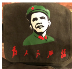
Yes, it CAN make you say, "Hu!" This week's second prize.

There's one hitch: To make the letters big enough to be read, the Empress left the numbers out of the squares, which means you can't tell me where your word appears on the grid. So: YOU MUST SUBMIT YOUR ENTRIES IN THIS FORMAT: