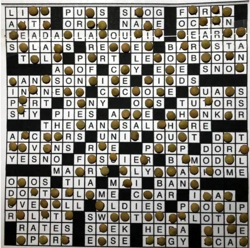
(Los Angeles Times crossword published in The Post July 11; © 2021, Tribune Content Agency)

By Pat Myers July 22, 2021 at 9:58 a.m. EDT