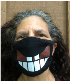
How the Empress manages to smile. The mask is this week's 2nd prize.

We just heard: There are now fire tornadoes. Just as "he could not possibly stoop any lower" could have been on a computer save-key of many a political columnist for the last four years, the year 2020 just keeps on outdoing itself with all sorts of novel reasons for despair, fear and universal hand-wringing.