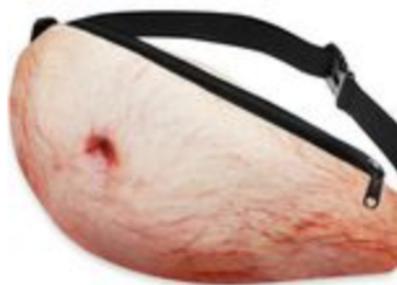
Get flabby abs instantly with NO exercise! This week's 2nd prize. (Rayki)

The Style Conversational The Empress's weekly online column, published late Thursday afternoon, discusses each new contest and set of results. Especially if you plan to enter, check it out at wapo.st/conv1351 .