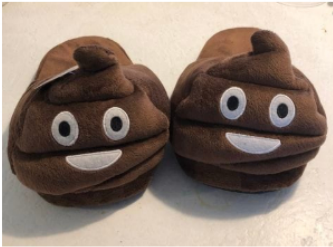
If you finish No. 2 this week, you win these poop emoji slippers.