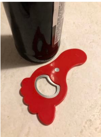
Our prize handy footy bottle opener; the other side advertises a funeral home.

How to find these contests? If you're a Post subscriber, you can go to washingtonpost.com/styleinvitational , where there's a list of the contests that you can click on one by one, starting from Week 1306. (Be sure to check the results of that week's contest, four weeks up the list, to make sure that your idea didn't already get ink for someone else.) If you're not — though you should be , you know — or if you'd like to search through a plain-text version of all the contests at once, go to the Loser Community's own website, nrars.org , click on “Master Contest List,” and scroll way down to Week 1282 and below. See last week's Style Conversational column at wapo.st/conv1309 for more directions. Please give the week number plus a brief ID of the contest your entry is for (e.g., “Week 1304, what-if jokes”).