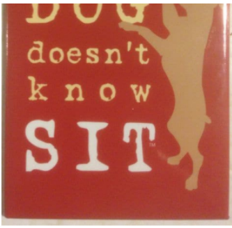
One of the fetching magnets that constitute our second prize this week.