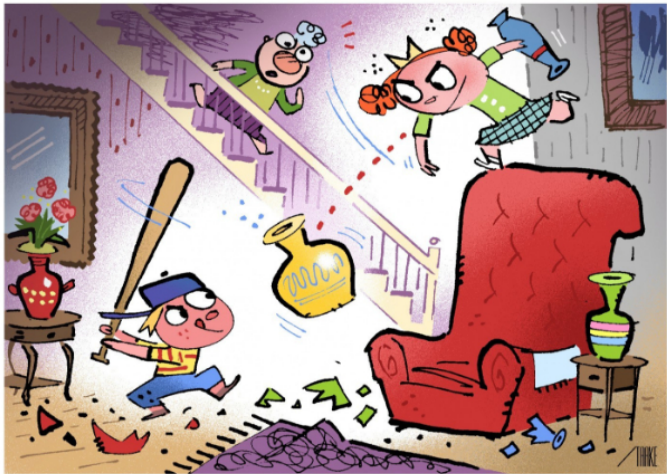
Vaseball: A neologism that got ink back in Week 278 and conveniently lacks a T, R, U, M and P.

Coin a new word (or redefine an old one) that has none of those letters; plus top movie mash-ups