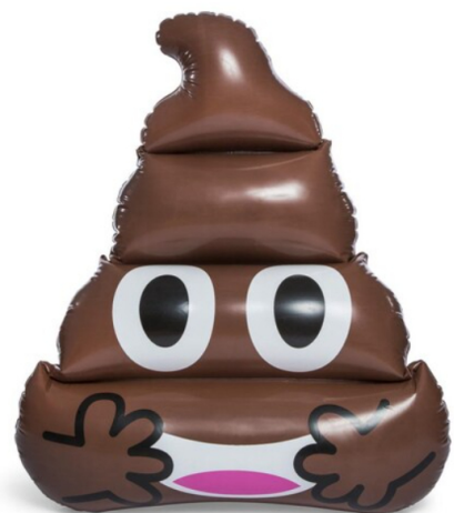
You'll have the pool all to yourself with this prize emoji-motif raft.

DEGREE: Combines "degrading" and "twee." "So what was it like to defend your dissertation in front of Professor Pomposity?" "Totally the third degree."