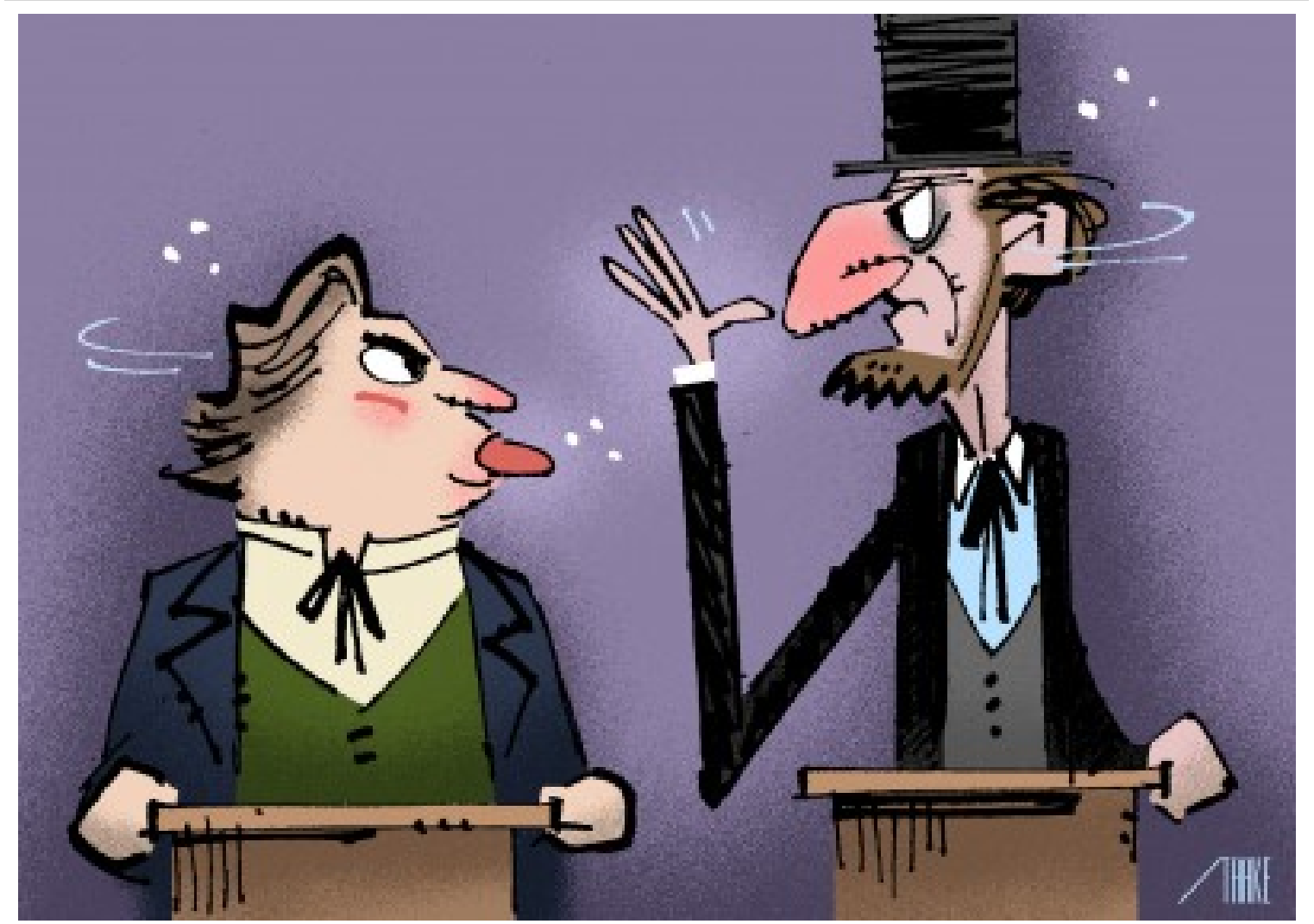
Stephen Douglas also famously said: "Look at that face? Would anyone vote for that?"