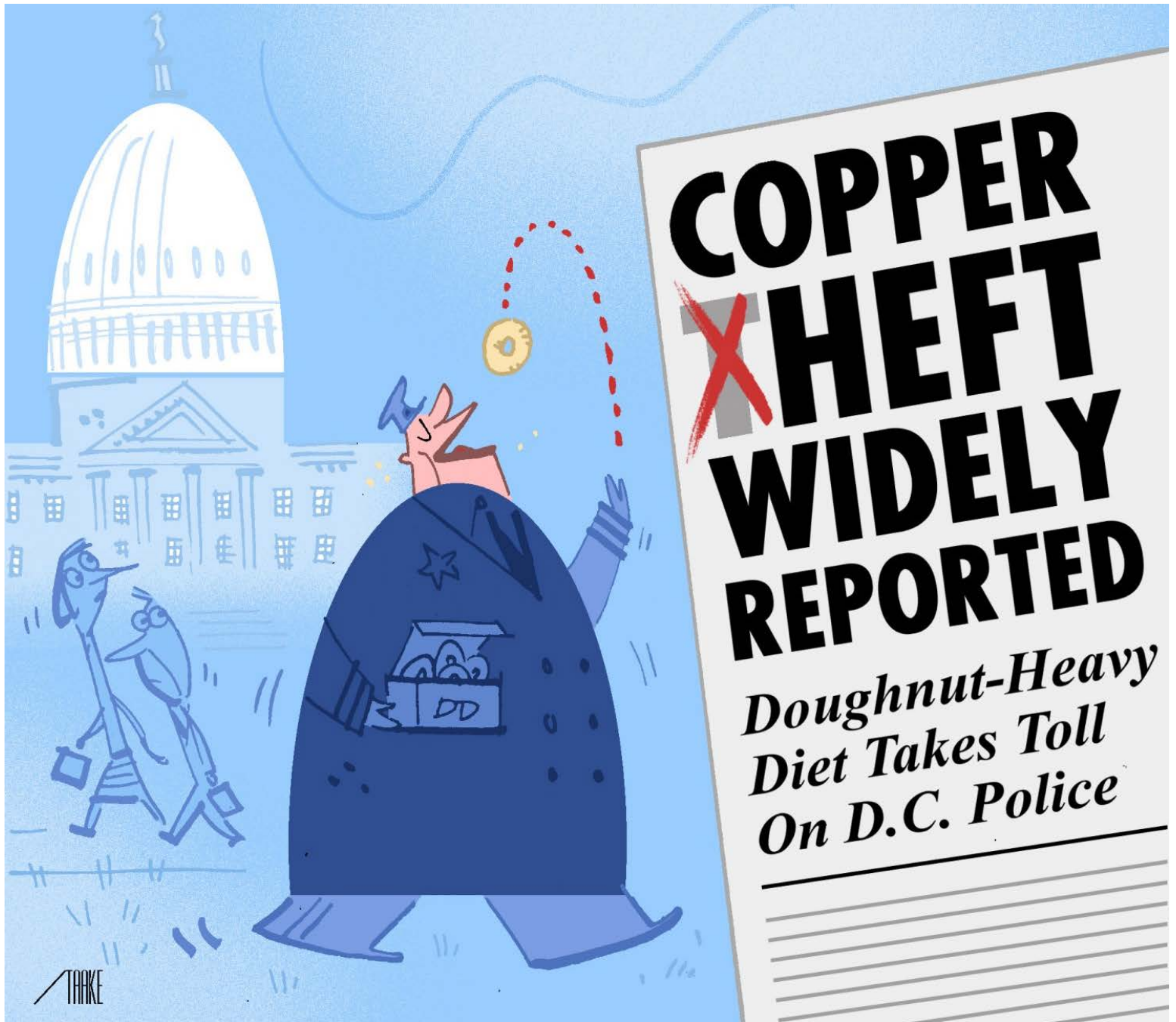
(Bob Staake/for The Washington Post)

By Pat Myers March 12 at 11:20 AM Follow @PatMyersTWP