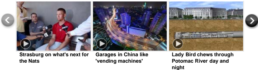
Strasburg on what's next for the Nats