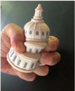
If you come in second this week, you can vent away. (Pat Myers/The Washington Post)

No, don’t write your entry on a copy of the cartoon. Just send us your plain ol’ words, please. How to format your entry: Begin with the letter labeling the cartoon, followed by a colon (A:, B:, C:, D:), and then follow it by your idea and caption on the same line. This will ensure that they’ll end up in the right group when the E pushes the Magic Sort Button. (You may attach a sketch to show what you’re getting at, but you must also describe it with text on the entry form.)