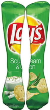
Bet you can't... well, who'd want to wear just one, anyway? This week's 2nd-prize socks.