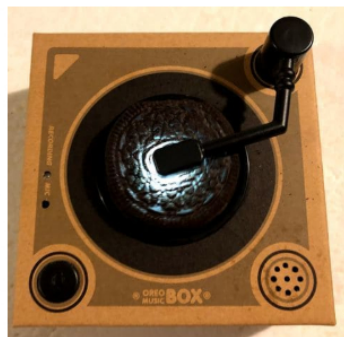
This music box spins a real Oreo but does not play "C Is for Cookie."