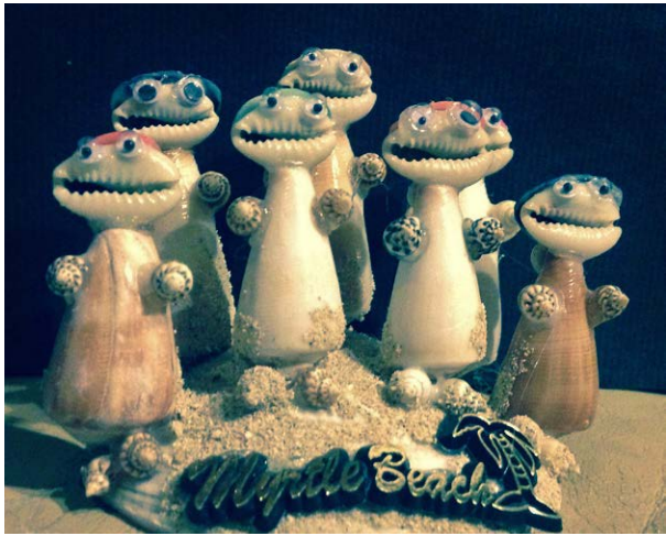
This week's second prize: The Joint Subcommittee on Shell Corporations. (Two members were off doing research on a Caribbean beach.)

Every two years, even when when the electorate doesn't much agree with her own political preferences, the Empress gets excited whenever there's a large turnover in Congress. (And not just at the Apple Pastry Appreciation Day press conference.) It's because there will be more freshmen's names to cobble together for the Invite's "joint legislation" contest, a game we've been playing since 1993. Actually, despite the big GOP gains in November, there are only 64 new people in the House and Senate for this 114th Congress (if you count people who've moved from one to the other) — which is a dozen or so fewer than in the 113th. So we're padding out the list by adding veteran senators whose names