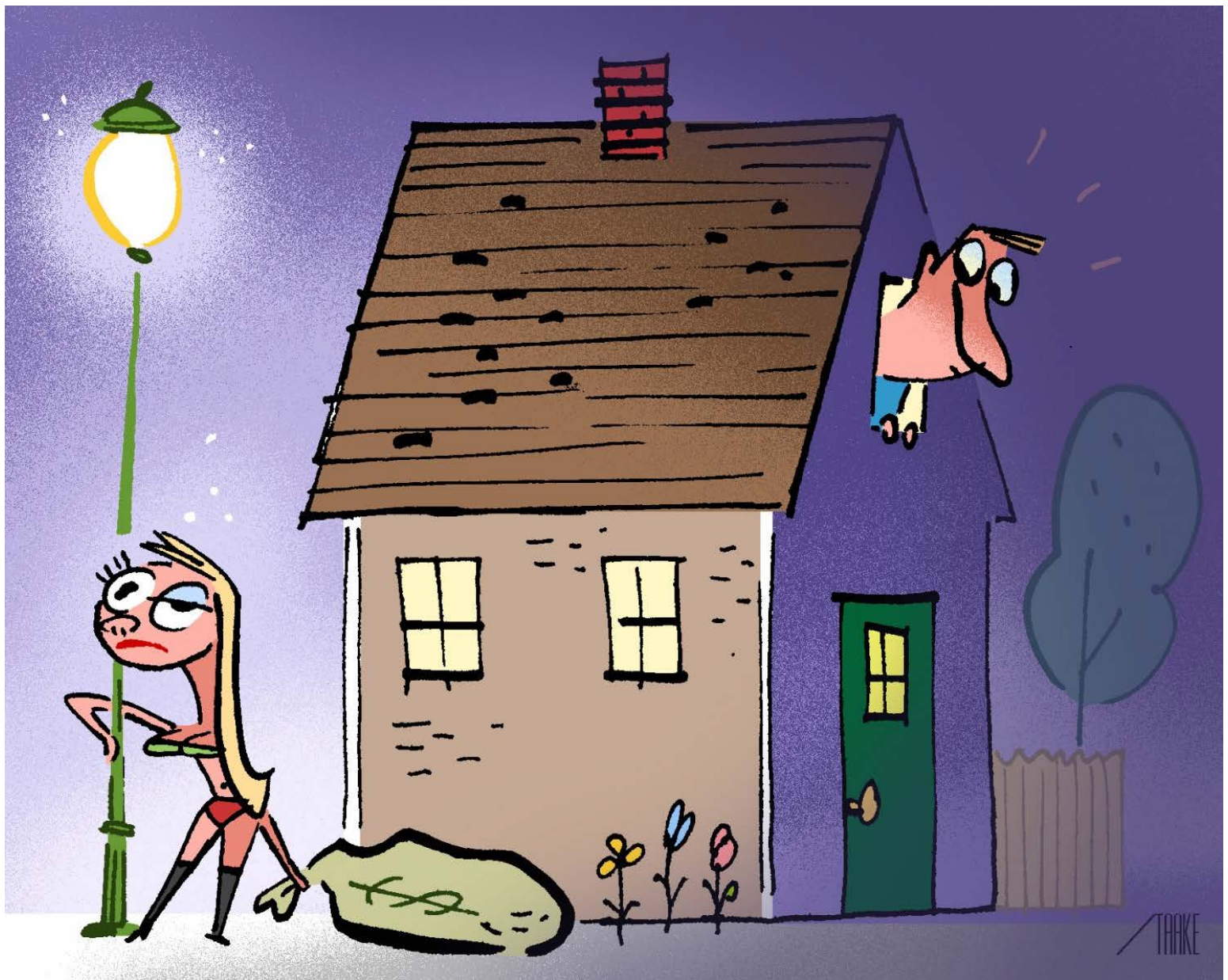
(The peniaphobe, by Bob Staake for The Washington Post )

By Pat Myers September 18 Follow @PatMyersTWP